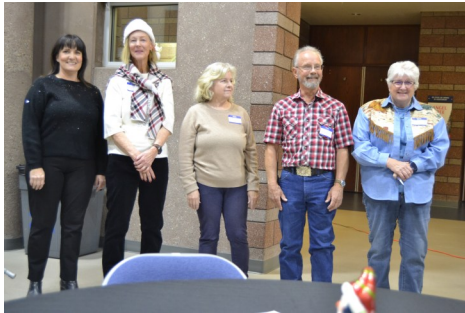
New Officers for 2026