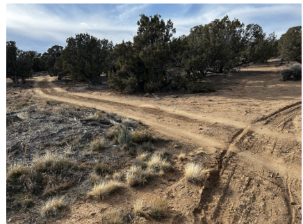
Trail crosses road