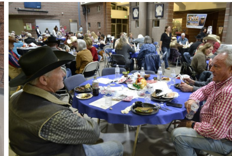
Enjoying the meal and friendship