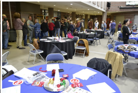
Dinner is served