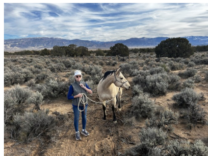
View from trail to obstacle course